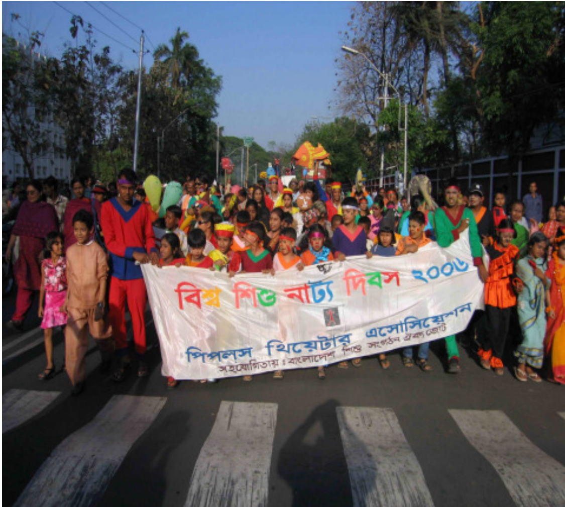
International World Day of Theatre for Children and Young People, March 20 th , 2008