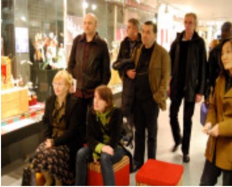
At the Israeli Puppet Theatre and Museum